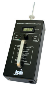
Mercury Vapour Indicator