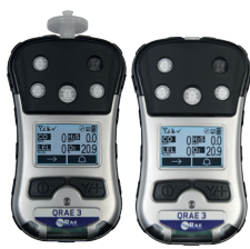
QRAE 3 (Diffusive and Pumped)