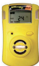
Single Gas Clip