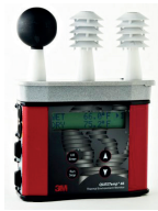
QT44 Data Logging Heat Stress Instrument (Waterless) From £210.00 per week