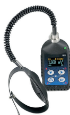
SV103 HAV From £250.00 per week