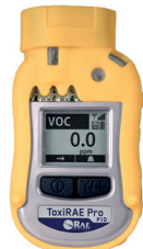
ToxiRAE Pro PID