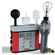
QT 34/36 Data Logging Heat Stress Instrument From £210.00 per week