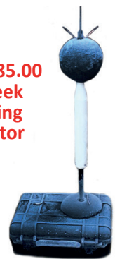
MOLES Outdoor Kit

From £185.00 per week including calibrator