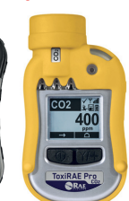
ToxiRAE Pro CO 2