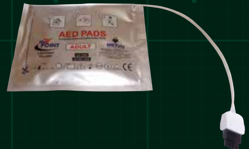
LPPP02 Life Point Pro Spare Paediatric Defib Pads