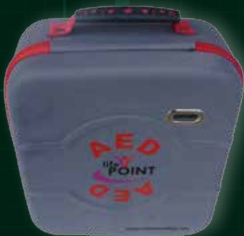
LPPAED Life Point Pro Automated External Defibrillator