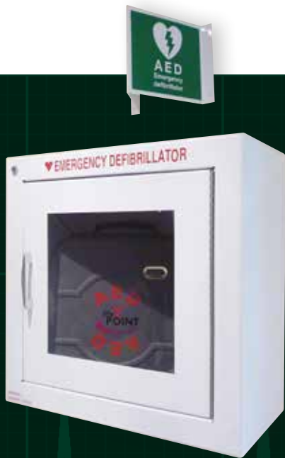
AEDC01 Alarmed Defibrillator Cabinet