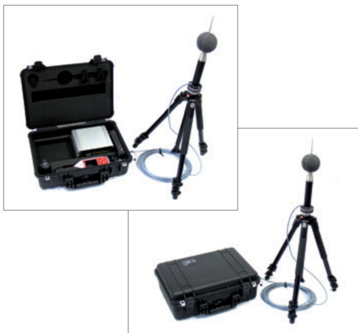
CK:670 Outdoor Kit shown with optional CT:7 Tripod

NoiseTools will display verification symbols if the information matches, a unique feature which will be useful in any legal proceedings.